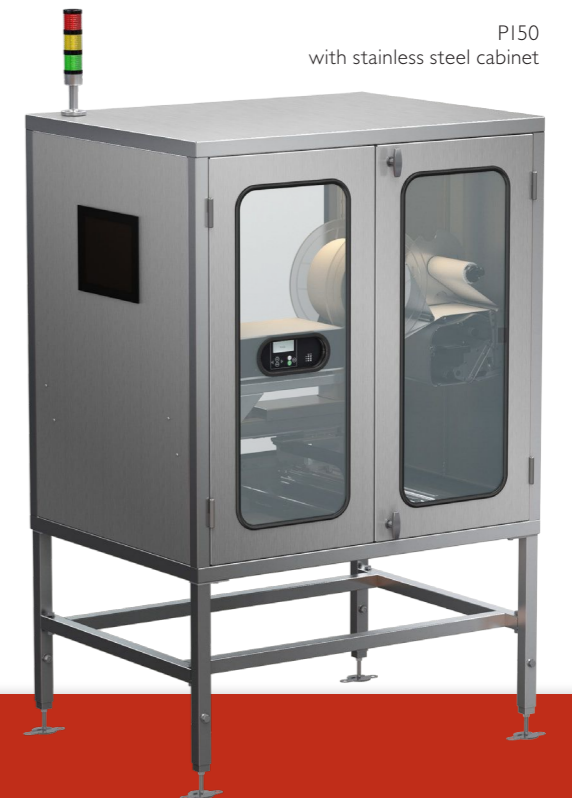
PI50 with stainless steel cabinet

Built-in functionality enables the PI50 to be automatically put into part pallet mode, which ensures safe and easy labelling of part pallets using Mectec's popular QuickDesign software. Alternatively, an additional desktop printer, DTP100 or DTP150, can be specified and integrated into the system to meet this requirement, while also acting as a back-up printer to the main pallet labeller.